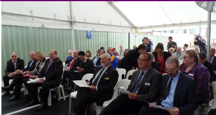
Above: The official ceremony to mark the expansion of the WWBH Renal Unit.