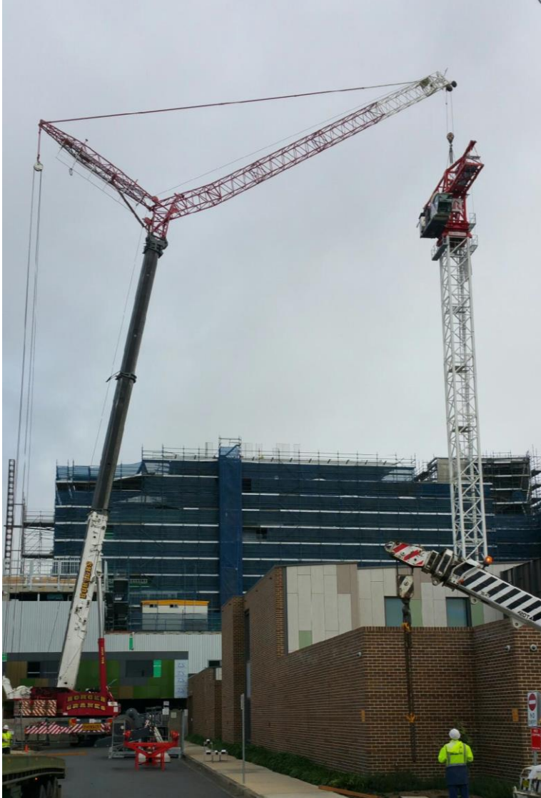
Above: Wagga's skyline reverts as Hercules comes down.