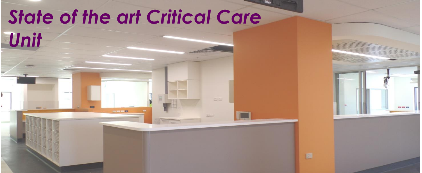
Above: First Look at the Critical Care Unit (CCU) in the Wagga Wagga Rural Referral Hospital.