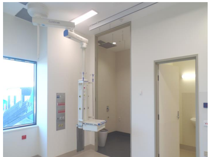
Above: An Isolation Room in the CCU.

Ceiling pendants eliminate the need for any cords or trip hazards around the patient's bed. The pendants are moveable and contain necessary equipment including intravenous poles.