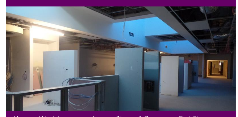
Above: Work is progressing on Stage 1 Recovery First Floor.