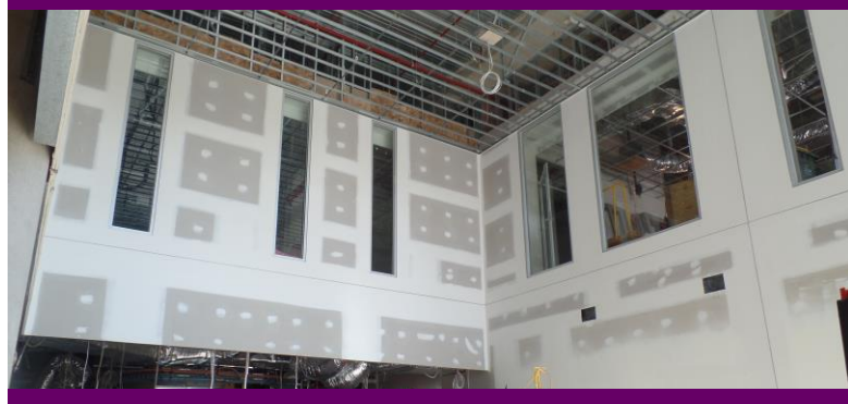
Above: The main Reception area is ready to be painted.